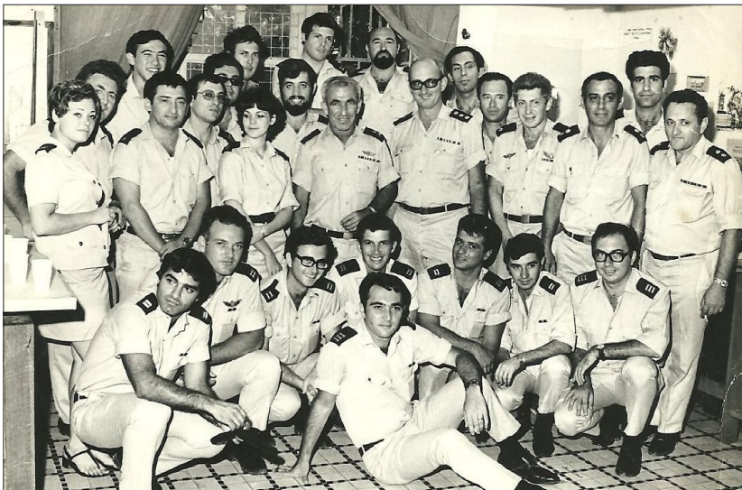
Fig. 3: Israeli Navy Commander Avraham Botzer and Department head Rami Lunz with naval intelligence officers, summer of 1972