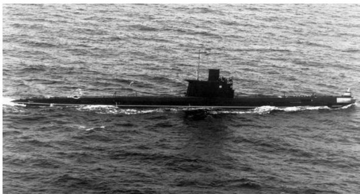
Fig. 4: A Romeo-class submarine, of the sort sold by the Soviets to Egypt and used in the Yom Kippur War to block shipping in the Red Sea