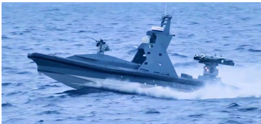
Figure 2 – The Protector unmanned Surface vehicle, which carries the Typhoon gun mount and Spike antitank missiles. 7