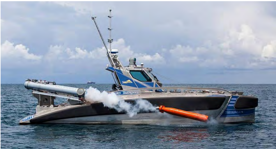
Figure 3 – Seagull unmanned surface vehicle fire torpedo 8