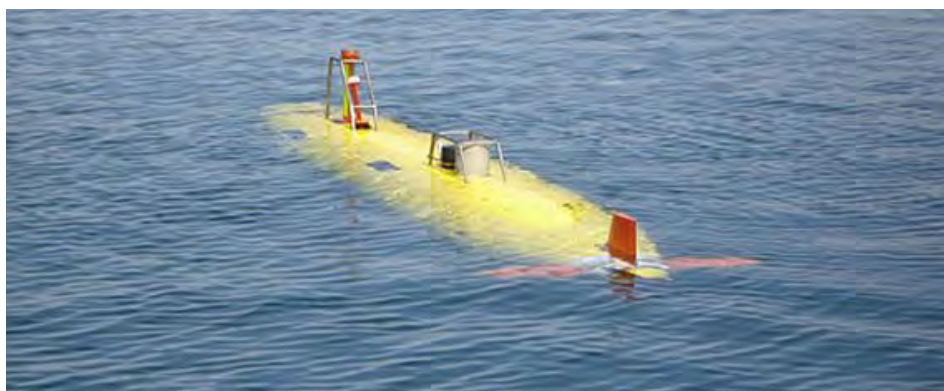
Figure 1 – Underwater unmanned vehicles 6